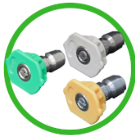
Pressure Cleaning Nozzles