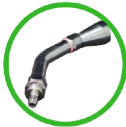
Versitech Open Head (VOH)