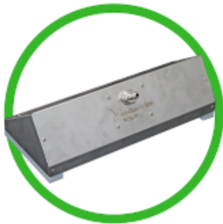
Versitech 35 Cover Head (VCH 35)